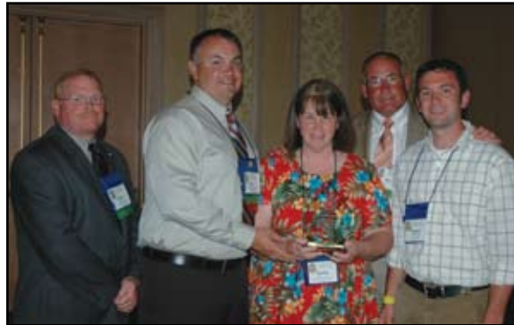
Region One Award: Spirit of America Foundation