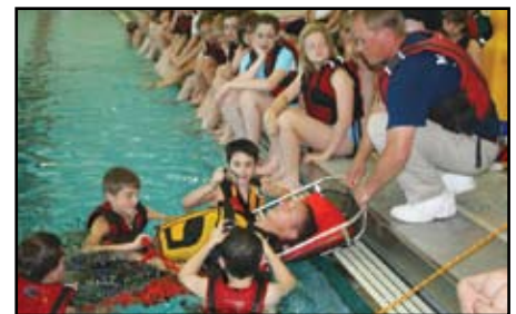
Thanks to Mentor (Ohio) Dive Team, Spirit students in Ohio learn about rescuing a victim from the water

The National Water Safety Congress, its' Board of Directors, Staff, and our partners in boating and water safety education publicly acknowledge and thank the U.S. Coast Guard for their continued support of these very important programs. We will keep you updated through this Journal and our web site.