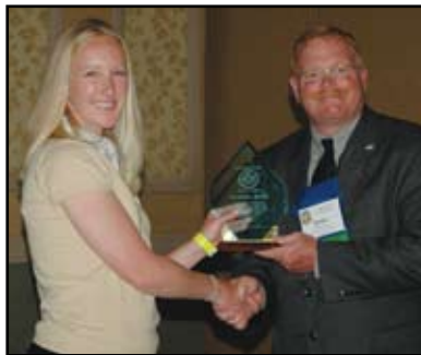
Region Three Award: J. Percy Priest Lake Park Rangers, USACE