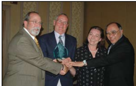
Region Six Award: RBS Arctic Team