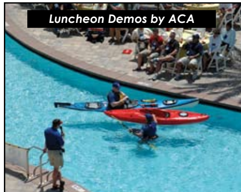
Luncheon Demos by ACA