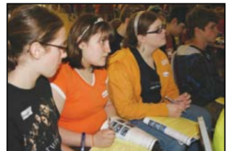
Spirit students in their NASBLA approved Ohio Boating Education Course, the first step in the Spirit of America Youth Education Programs.