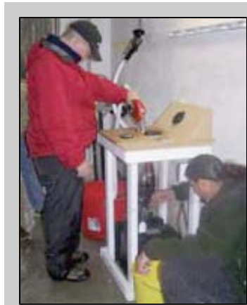
To test the hardware, we built a mock-up of a boat fuel tank system, complete with a tank vent.