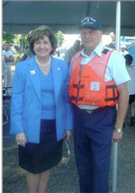
Caption: Louisiana Governor Kathleen Babineaux and Auxiliarist Mike Clayton, VFC of 4-4 in Lafayette, LA.

Local Auxiliarists staffed the Crawfish Festival exhibit and used the opportunity to promote "You're in Command! Boat Responsibly!" They emphasized life jacket wear, America's Waterway Watch, and recruitment of new members. Auxiliarists wore modern life jackets to demonstrate how new lightweight styles are perfect for hot weather. Many visitors signed up for Vessel Safety Checks and Boating Safety Courses.